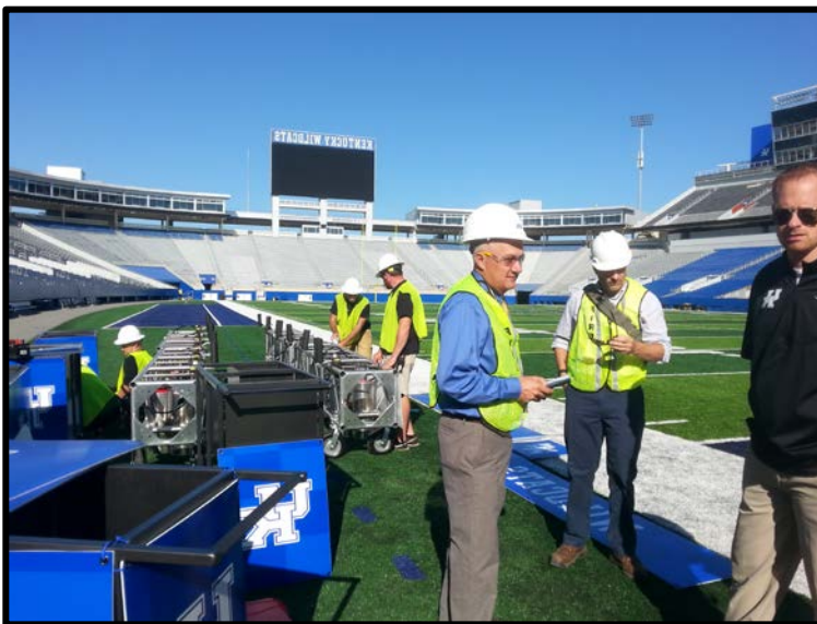
Fire Marshal's Office meets UK Athletics for review and inspection of Pyro equipment for 2015 UK Football Season