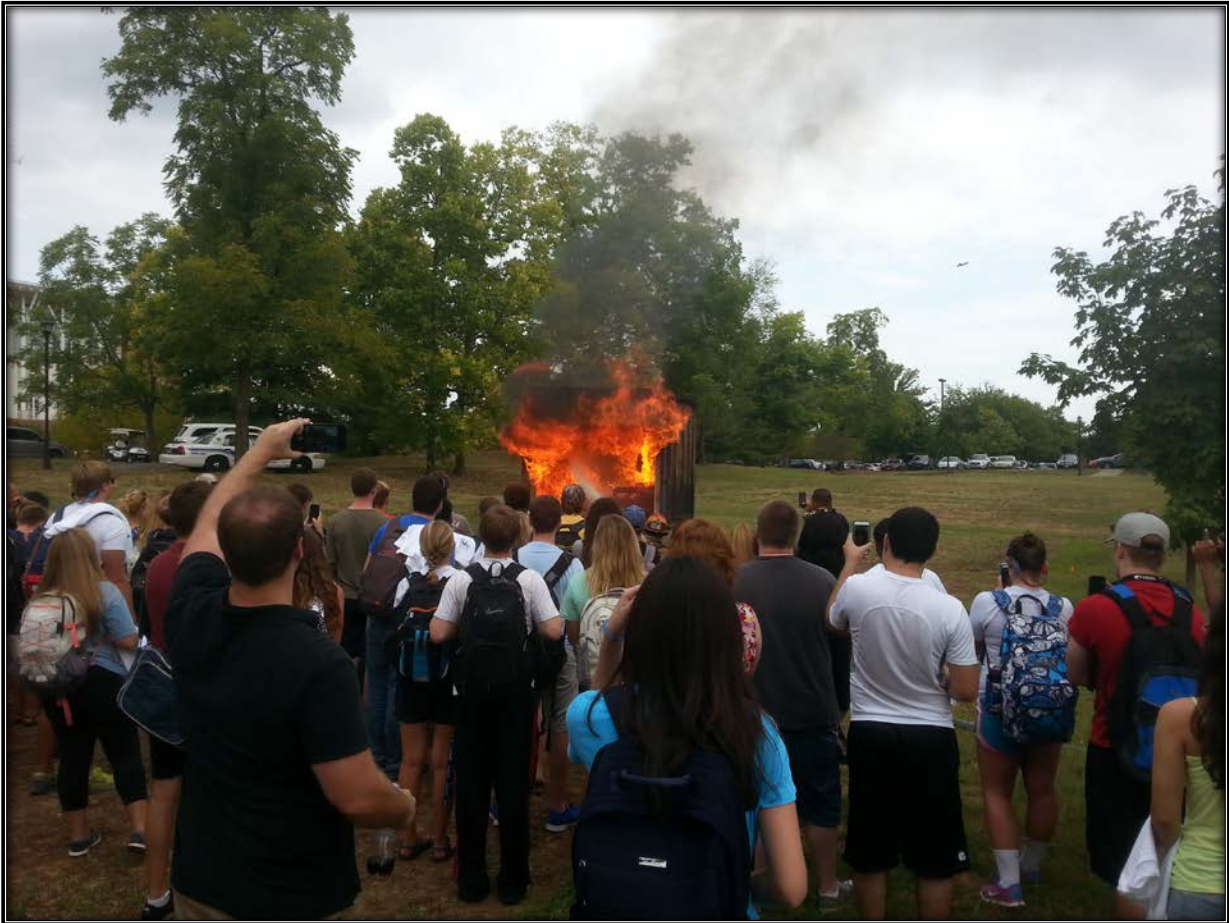
Woodland Glen Dorm Room Burn - September Fire Safety Month