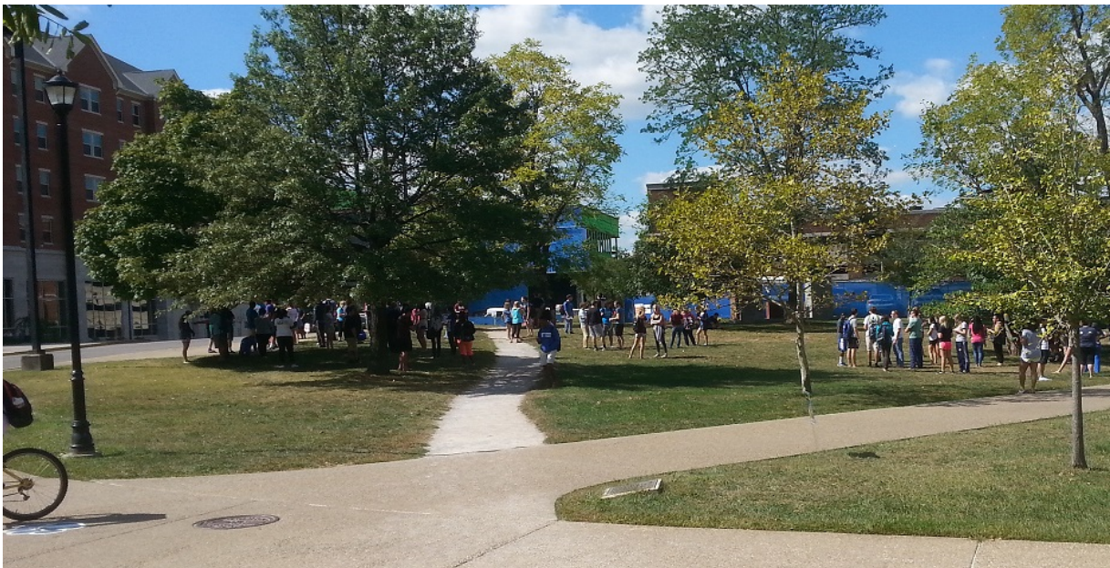
Asst. Fire Marshal Jason Ellis Oversees the Fire Drill at Haggin Hall/2015

(3) Smoke Detectors - Smoke sensing devices installed in required locations. Sounds a local alarm in the facility affected.